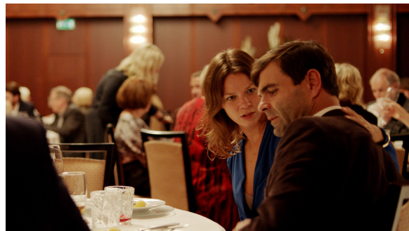
HANDS OF A MOTHER