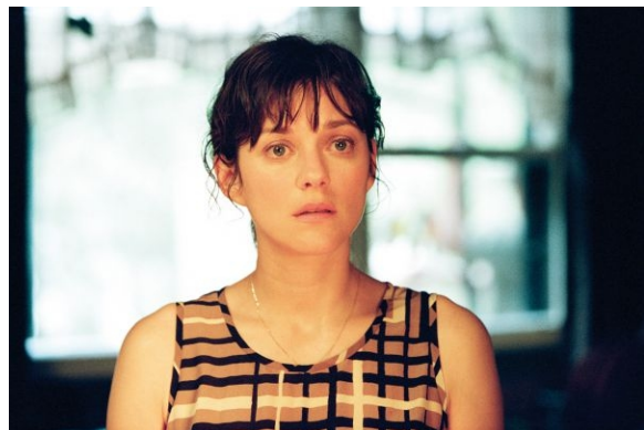
IT'S ONLY THE END OF THE WORLD